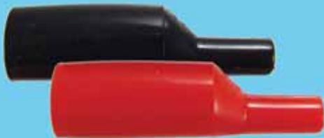
Insulator for 501784 & 501785 Series