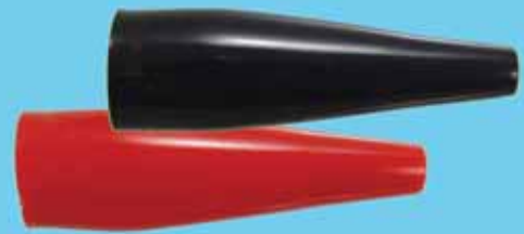
Insulator for 501994 Series