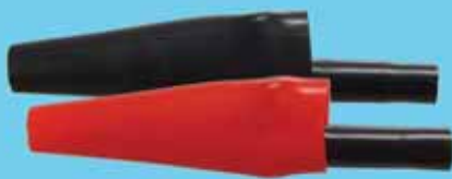
Alligator Clip, Steel Insulated, 10 Amp