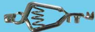
Analyzer Clip, Steel, 10 Amp