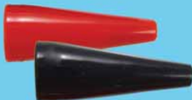
Insulator for 501995 Series