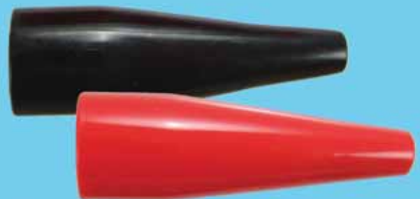
Insulator for 501797 Series